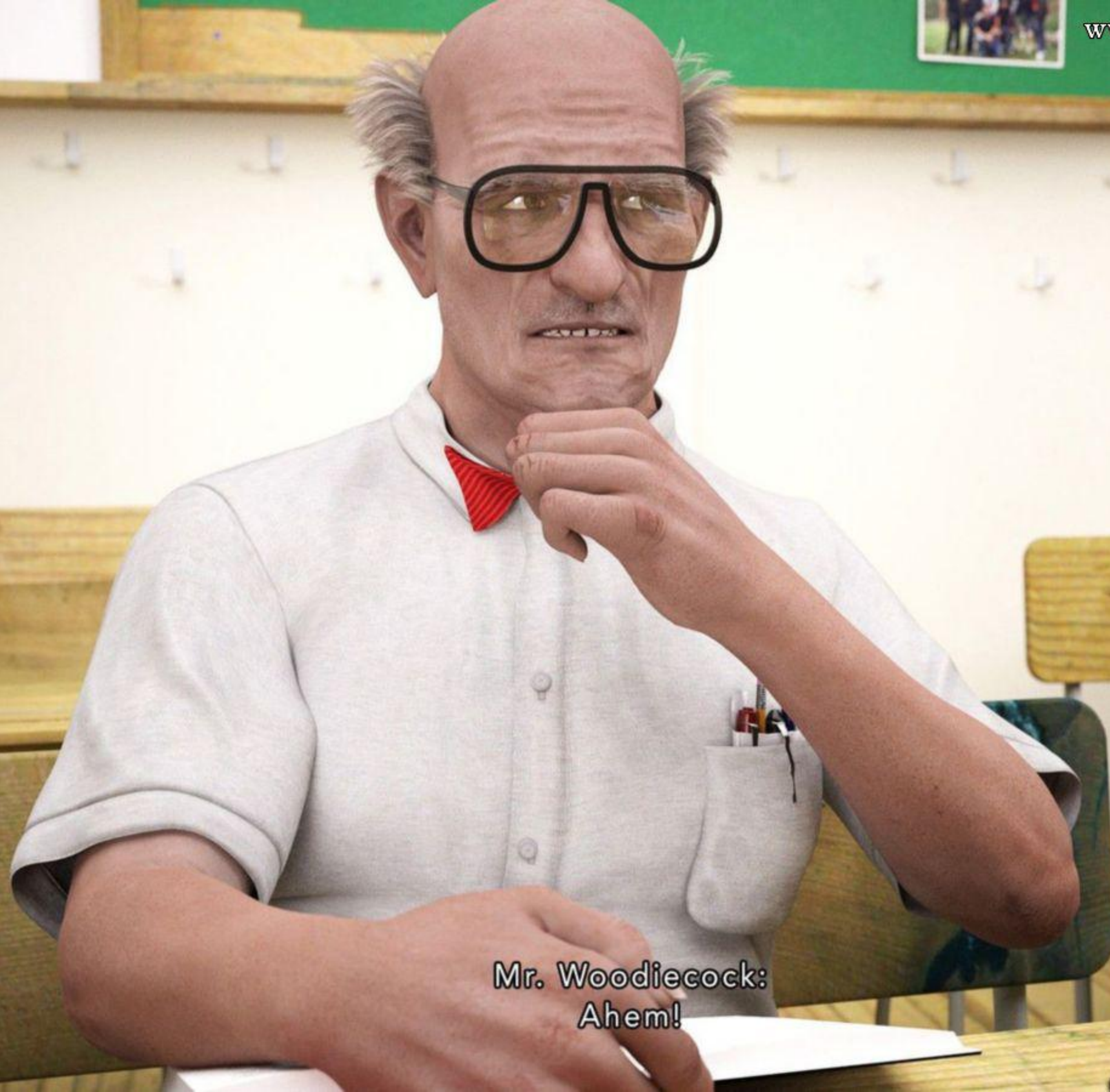
Mr. Woodiecock: Ahem!