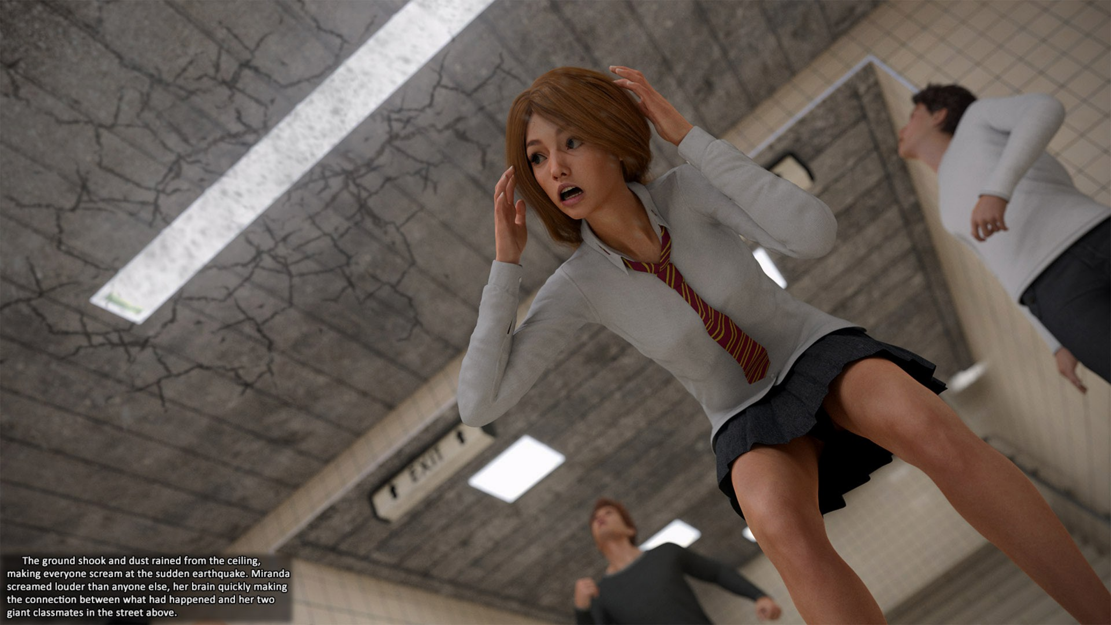
The ground shook and dust rained from the ceiling, making everyone scream at the sudden earthquake. Miranda screamed louder than anyone else, her brain quickly making the connection between what had happened and her two giant classmates in the street above.