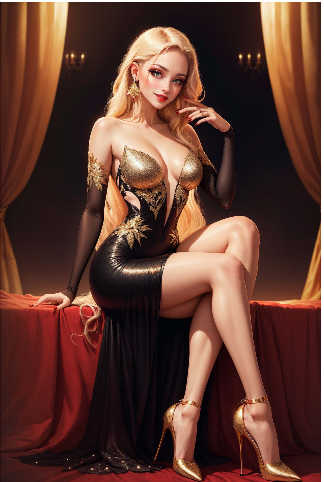
He was smiling gaily at the photographer, his lips parted in fun, his eyes filled with mischief.