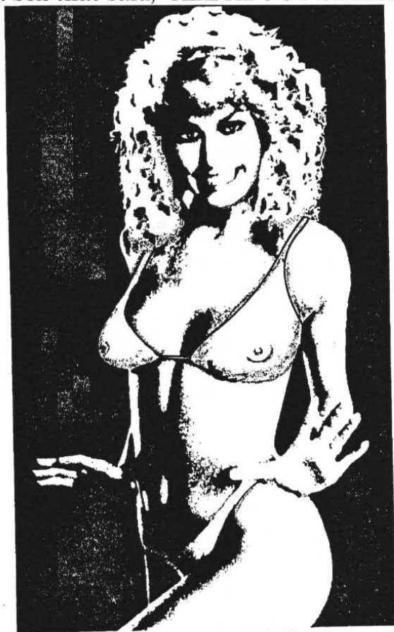
"ALL ABOUT SHELLEY"

I started to make a fatherly comment about cleaning his room up but put my self in check. I had much more important things to straighten out. On the desk, next to the TV was Shelley modeling profile. On the cover was a black and white picture of Shelley in a string bikini, and a box that said, "ALL ABOUT SHELLEY."