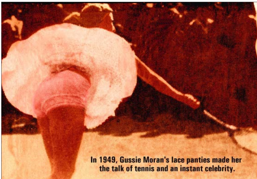
In 1949, Gussie Moran's lace panties made her the talk of tennis and an instant celebrity.