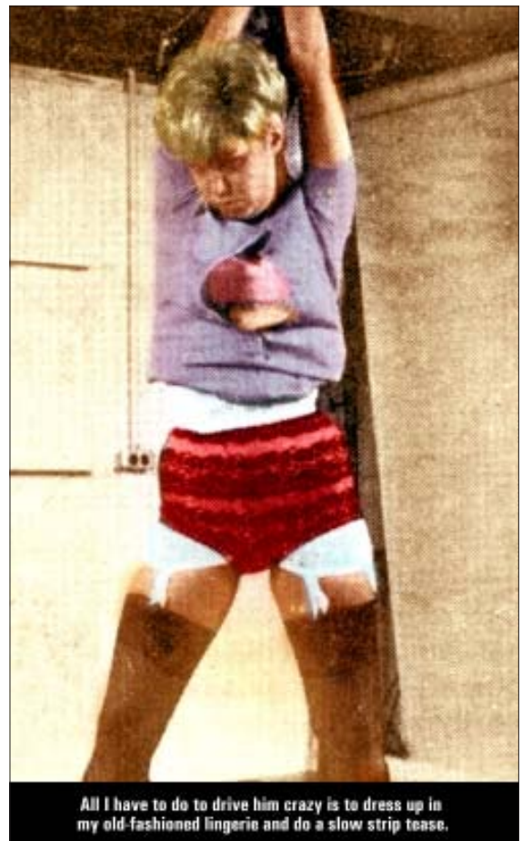
All I have to do to drive him crazy is to dress up in my old-fashioned lingerie and do a slow strip tease.

Whenever he wants some new clothes, we plan a full day of shopping. We go to another town to buy women's clothes for him. While we are doing this, he's fully dressed as a woman from head to toe; I can make him look pretty convincing. Still some people, kids in particular and especially young girls, guess he's a guy. It embarrasses him to no end when we're out in public and some little preschooler will ask his mother "Why is that man wearing a dress?" Or most recently, we crossed paths with a group of preteen girls and they guessed it right away. They started laughing and pointing fingers and ended up following us all around the mall, making comments like "I think he's cute" and "I wonder what kind of panties he has on" – all loud enough so we could hear it. But I love how it makes him squirm. ♦