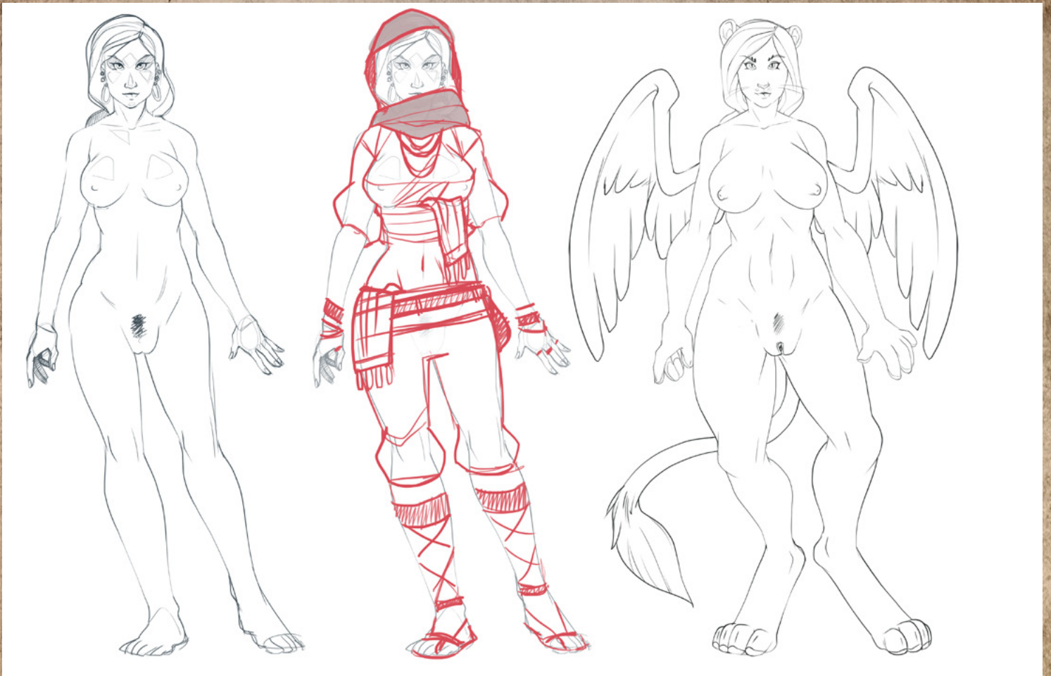
Hanna (human and sphinx)