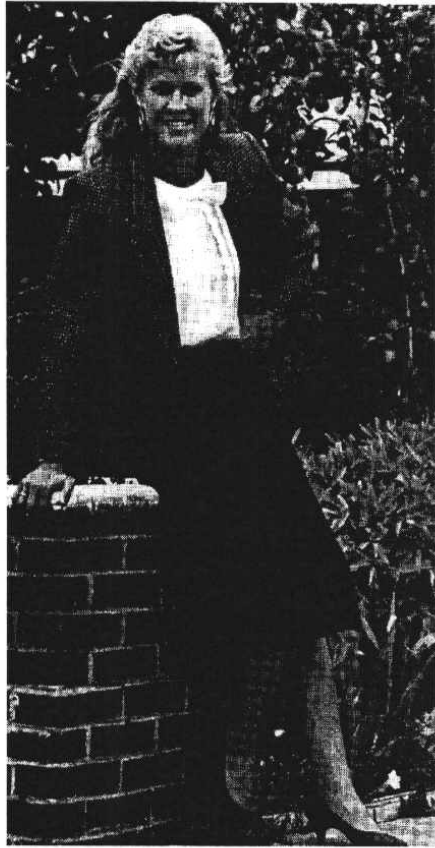
"Larry no longer looked like a boy."

Another month passed before I saw my friend again. I was in the shopping mall looking for some shoes when I heard my